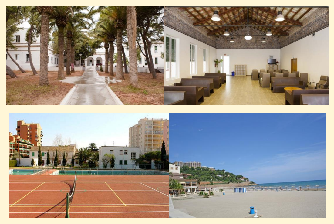
Adress: Av. Ferrandis Salvador, 40, 12560 Benicasim, Castellón

The exchange will be held in the Argentina hostel, located in the middle of Benicàssim. The participants will stay in non-mixed, 2-5 people bedrooms. Among the facilities there are basketball and tennis yards and a swimming pool, in addition to being right next to the beach. Temperatures in October can reach 30°, so you may need your swimsuit!